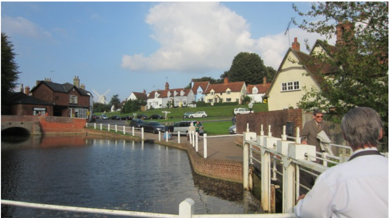
The end of a glorious sunny day in the beautiful village of Springfield, and our weekend in Essex.