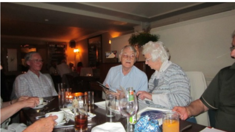
Members assemble at the White Hart Inn for a group Dinner on Saturday evening.

My thanks to the various Members who contributed photos. (Editor)