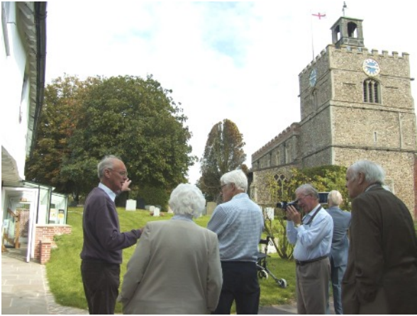
One of the Guildhall Trust members describing some of the finer details of the building.