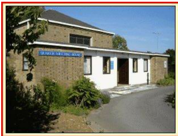
Chelmsford Quaker Meeting House